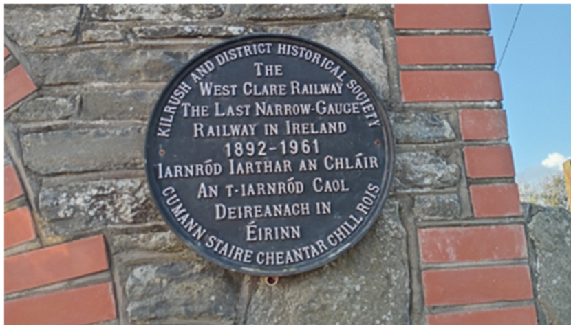
Plate 16.91: Plaque on the stone-built arch