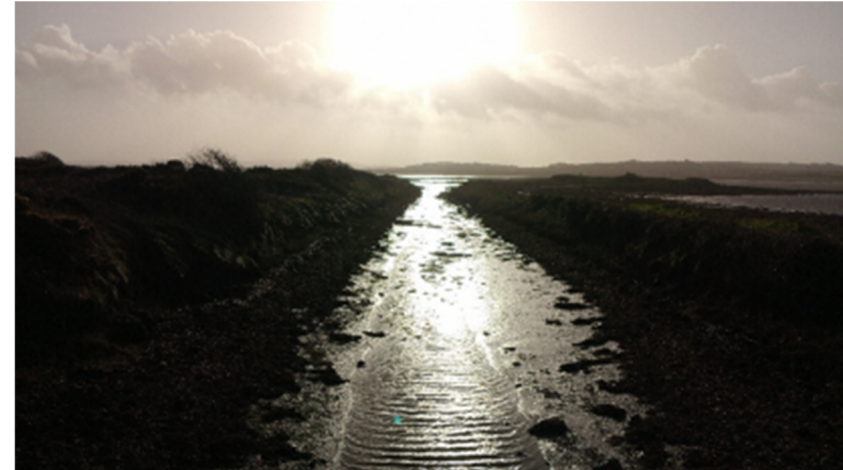
Plate 16.56: Large drainage feature (CH1.25), facing south-southwest