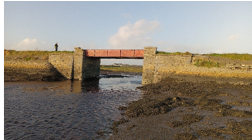
Plate 16.36: Disused railway bridge (CH1.10), facing northwest