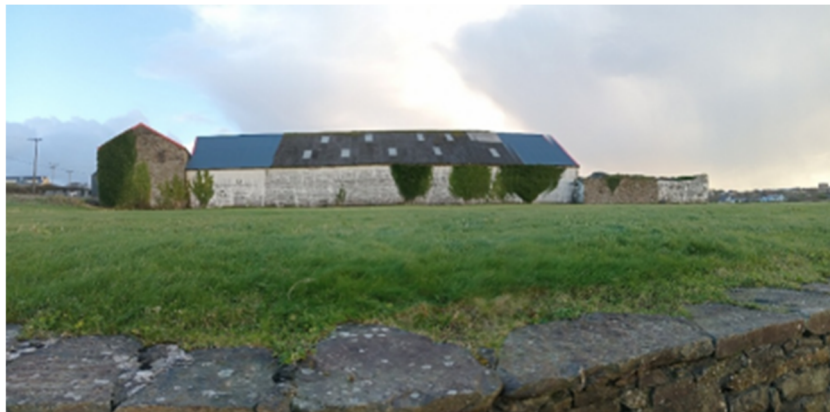
Plate 16.81: Complex of three industrial buildings (BH18) facing east-northeast