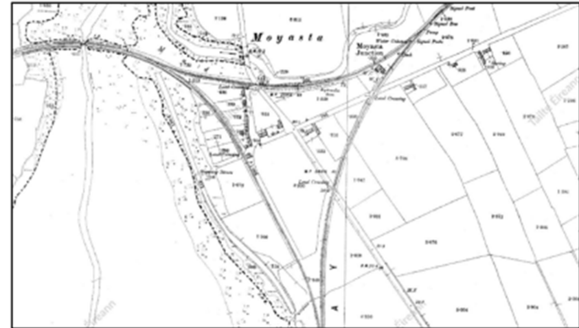
16.38: Extract from the 1898 OS map showing the Moyasta Junction railway