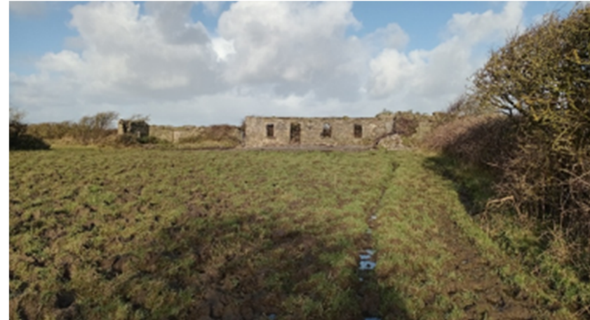
Plate 16.64: Three ruinous stone-built structures (CH26), facing north