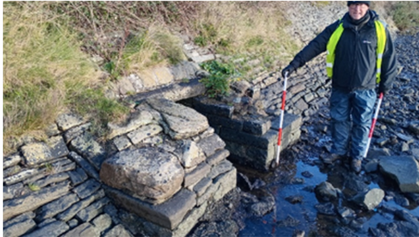
Plate 16.79: Culvert within stone-built embankment, facing northeast