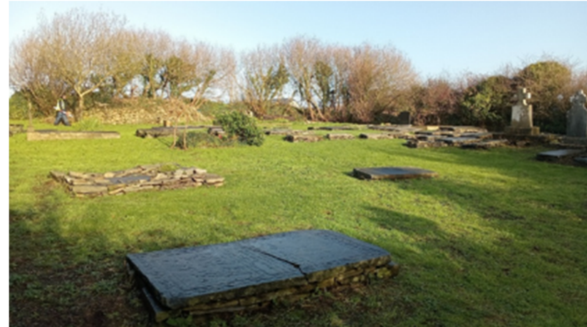
Plate 16.30: Kilnambanorha Graveyard (AH11 and AH12), facing northeast