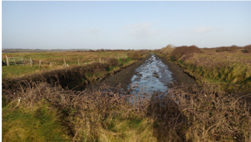
Plate 16.55: :Large drainage feature (CH1.25), facing north-northeast