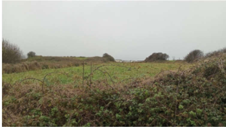
Plate 16.5: Former railway line (CH1) in Dough townland, facing west-northwest