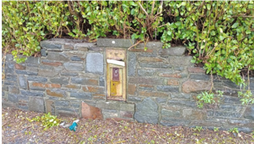
Plate 16.21: Postbox (CH31), facing north