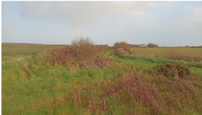
Plate 16.53: Moyasta-Carrowncalla North townland boundary (TB5), facing east