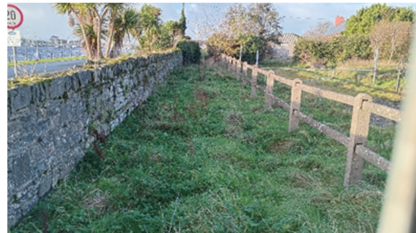
Plate 16.92: Short stretch of former railway (CH1), facing west