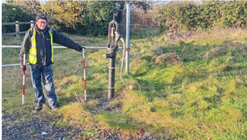
Plate 16.93: Water pump (part of CH1.21), facing west