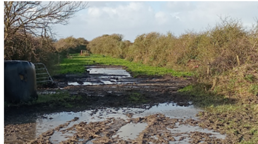
Plate 16.62: Former railway line (CH1), facing west-northwest