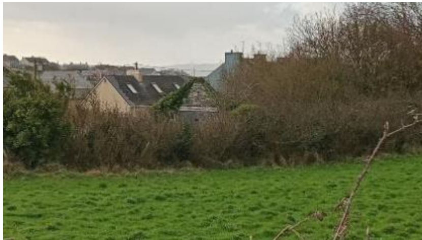
Plate 16.83: Northern gable end of Engine House (BH19), facing south