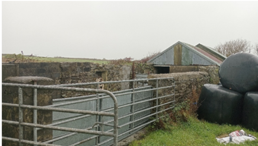
Plate 16.11: Ruinous vernacular house (CH5), facing east