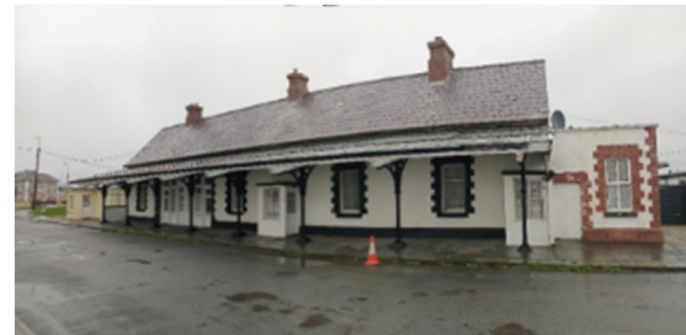
Plate 16.4: Former Kilkee Railway Station (BH11), facing northwest