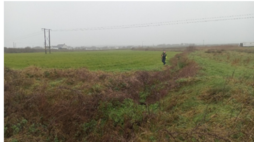
Plate 16.8: Dough-Lisdeen townland boundary (TB1) and the former railway (CH1), facing north