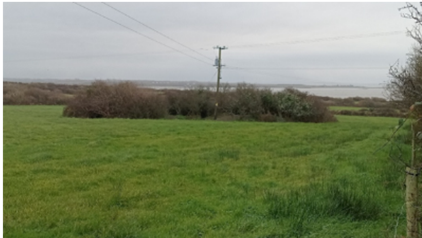
Plate 16.27: Ringfort (AH8), facing southeast