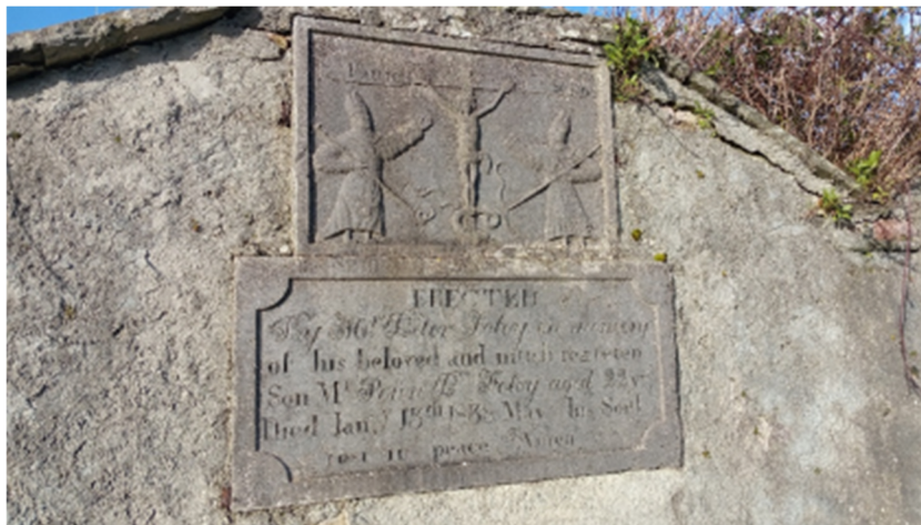
Plate 16.73: Detail of mausoleum- St Patrick and St Senan, flanking the crucifixion and attacking snakes