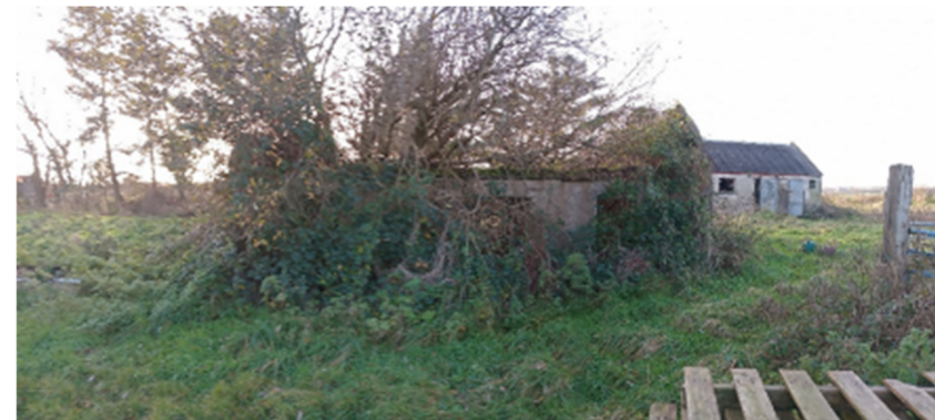
Plate 16.44: Ruined structures (CH17) within former railway yard, facing west