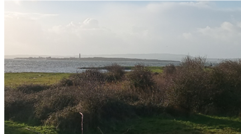
Plate 16.68: Scattery Island (CL067-024001; Nat. Mon. 10), as seen from Leadmore West, facing south