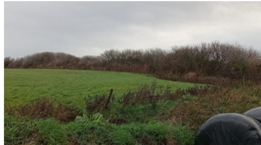
Plate 16.28: Garraun-Baunmore townland boundary (TB3), facing northeast