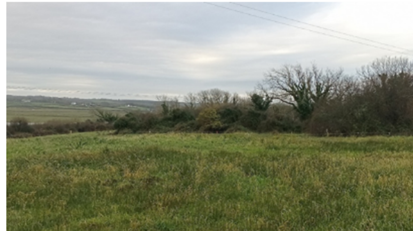
Plate 16.26: Ringfort (AH7), facing southwest