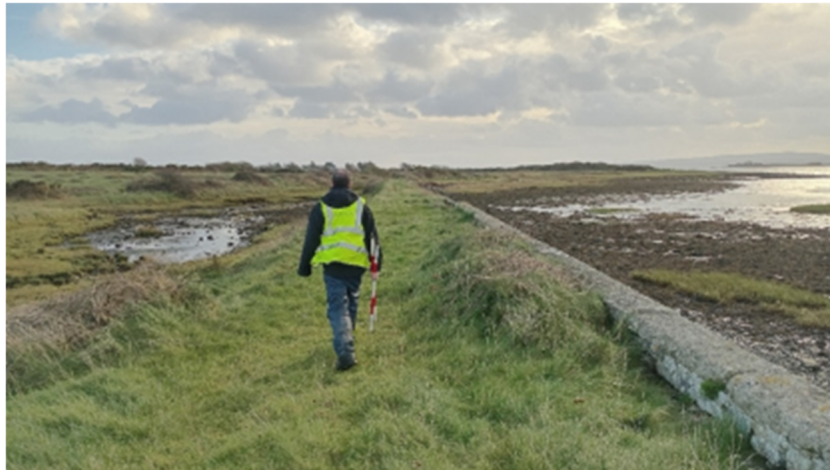
Plate 16.61: Former railway line (CH1) on raised causeway in the Shannon mudflats, facing south