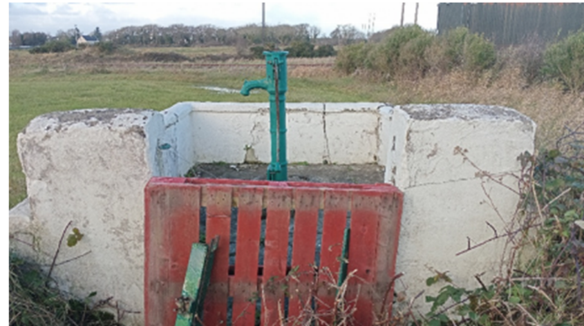
Plate 16.50: Water pump (CH1.11) at Moyasta Junction, facing north