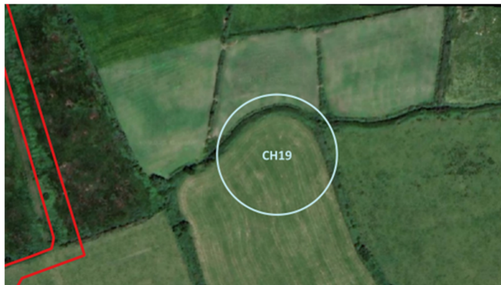
Plate 16.3: Curving field boundary and sub-circular anomaly CH19