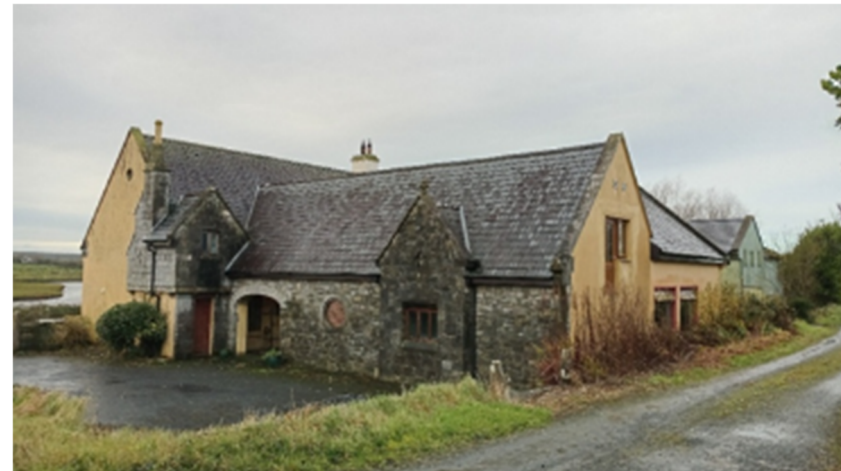
Plate 16.20: Holiday apartments (CH1.7) situated to the west of the L2016 local road, facing southwest