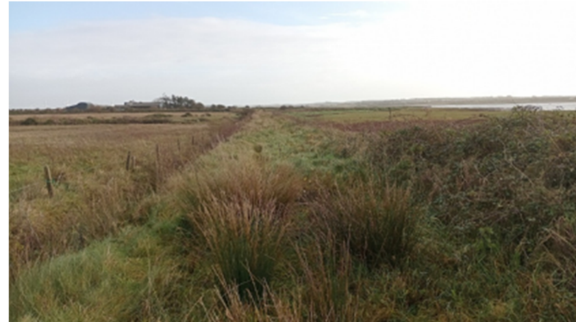
Plate 16.34: Former railway (CH1), facing east