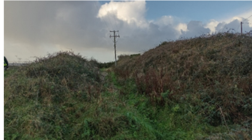
Plate 16.80: Former railway (CH1), facing east-southeast