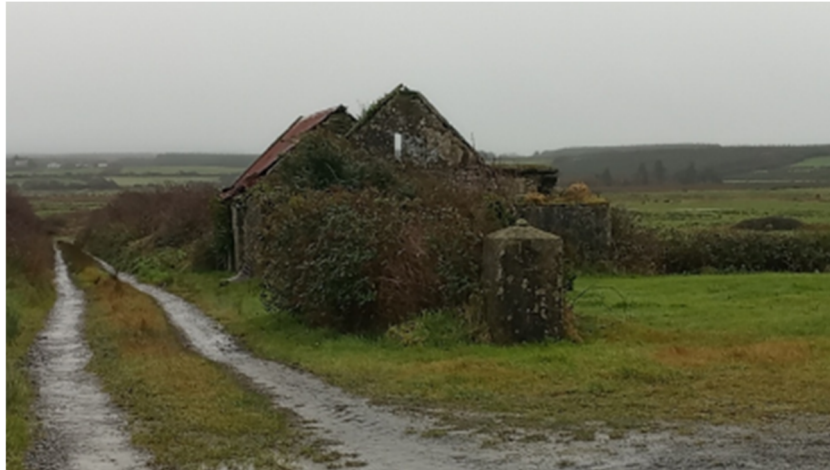
Plate 16.17: Ruinous structure (CH7), facing south