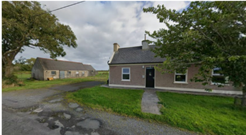
Plate 16.51: Vernacular house (CH15), facing east-southeast