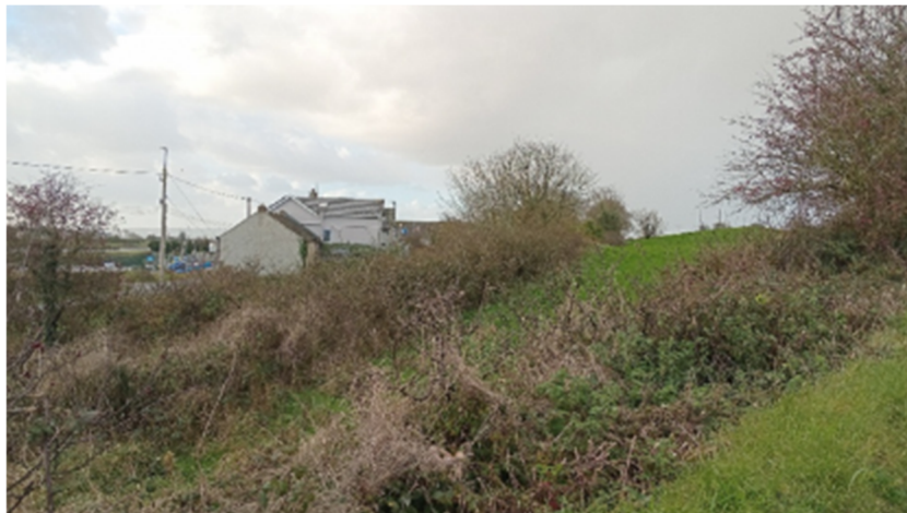
Plate 16.85: Former railway (CH1) between Merchants Quay and Shanakyle Road, facing southeast