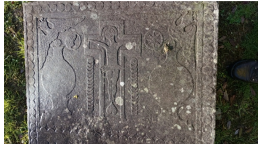
Plate 16.32: Gravestone dated 1848