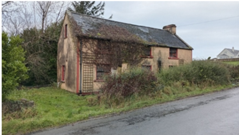
Plate 16.23: Derelict house (CH32), facing northwest