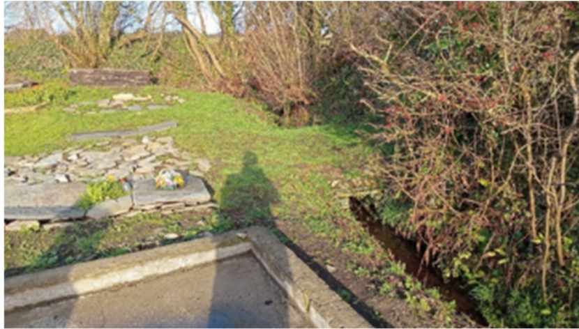
Plate 16.33: Water channel in the east side of Kilnambanorha Graveyard, facing northwest.