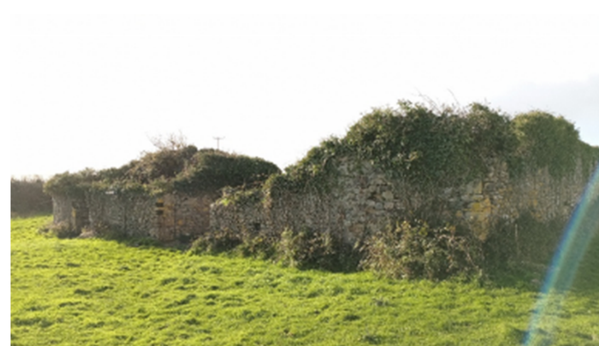
Plate 16.74: Ruinous vernacular cottage (CH29), facing southwest