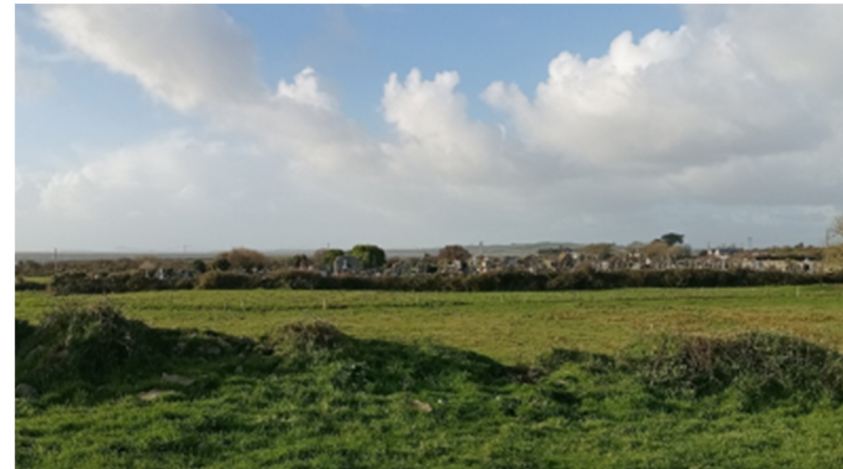
Plate 16.70: The Old Shanakyle Graveyard (AH26 and AH27), facing west