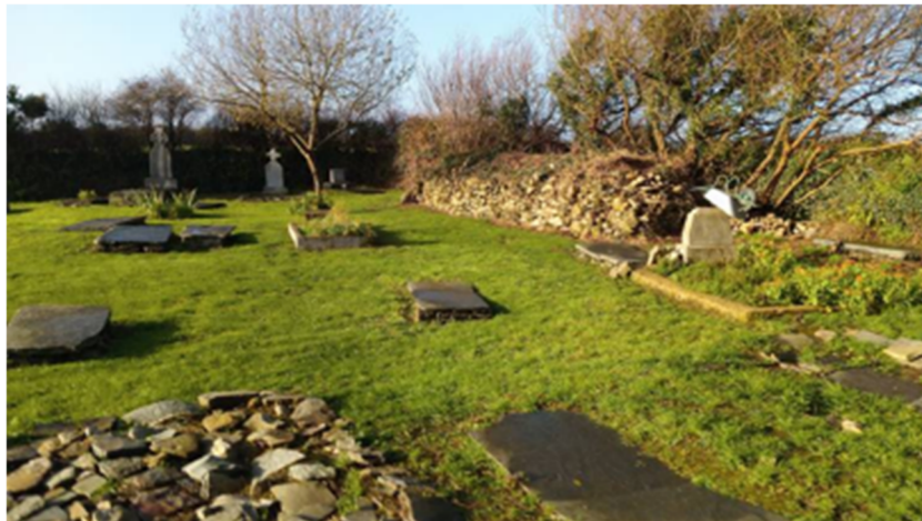
Plate 16.31: Clearance cairn, facing west-northwest