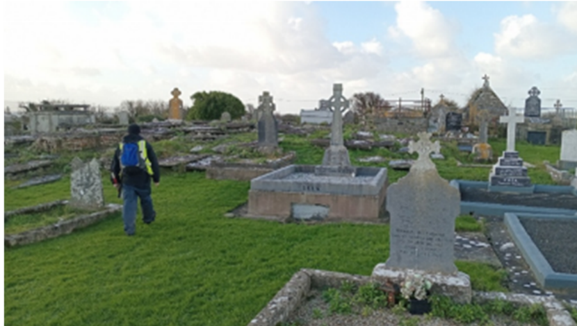
Plate 16.71: Old Shanakyle Graveyard (AH27), facing east