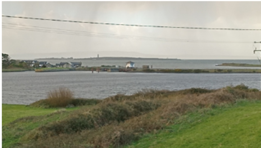
Plate 16.69: Former railway (CH1) overlooking Kilrush Marina, Kilrush Locks (CH36), Scattery Island and the Shannon Estuary, facing southwest