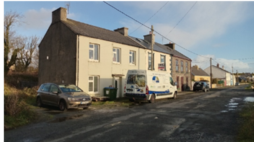
Plate 16.82: Historic houses (CH30), facing northeast