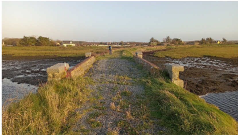
Plate 16.37: Disused railway bridge (CH1.10), facing east