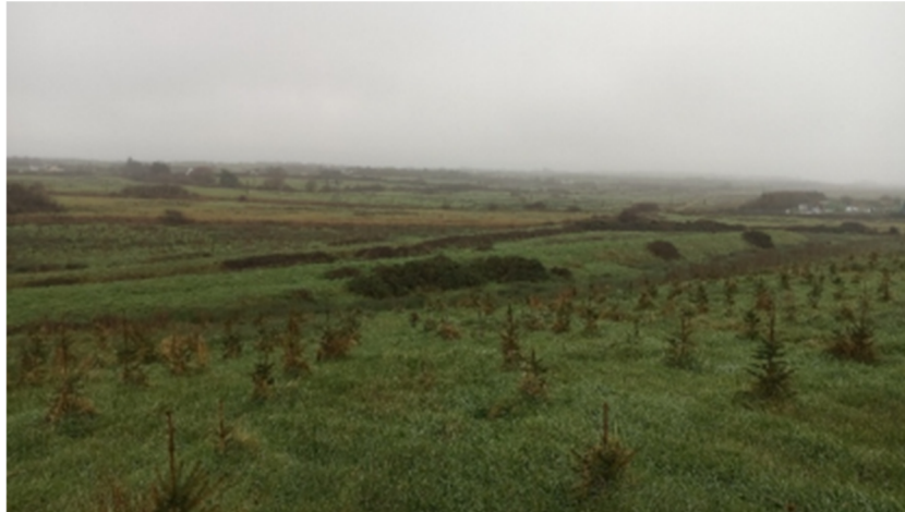
Plate 16.13: Main railway line (CH1) and short spur line (CH1), facing northeast