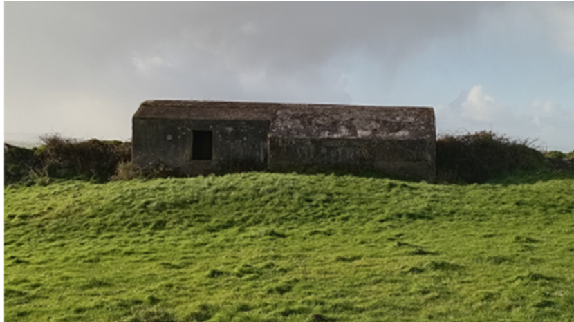
Plate 16.75: Concrete structure (CH30), annotated 'Ice House' on the 1898 OS map, facing west