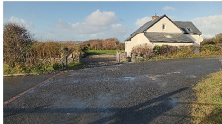
Plate 16.66: Former level crossing keeper's cottage (CH1.20), facing west