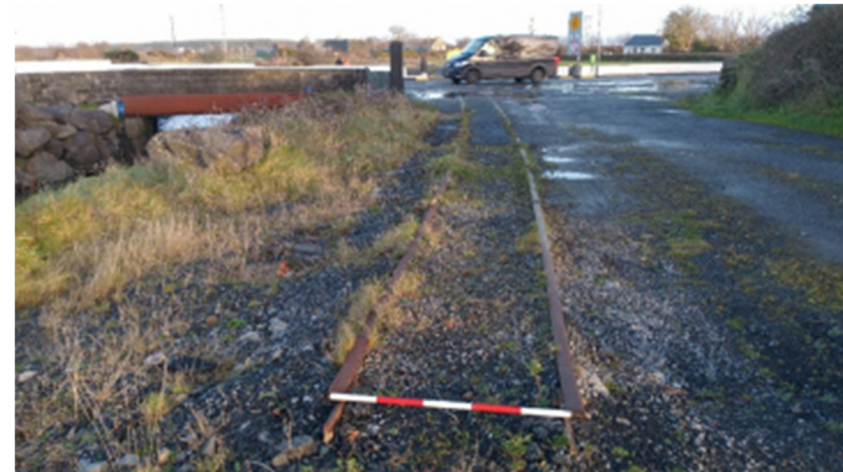
Plate 16.42: Narrow gauge railway (CH1.12), facing east-southeast