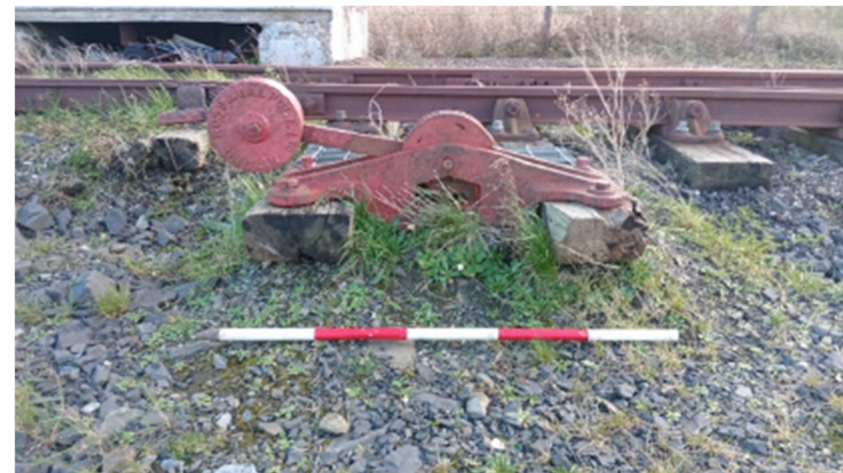
Plate 16.48: Point lever (CH1.11), facing south