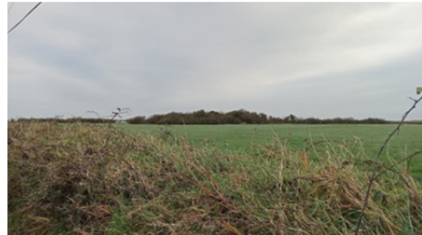
Plate 16.24: Ringfort (AH5), facing northeast