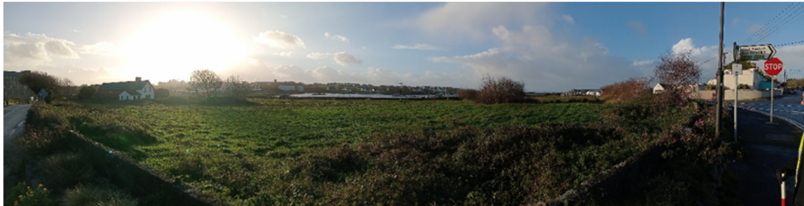
Plate 16.88: Panoramic view of CH1.21 where the proposed scheme terminates, facing south