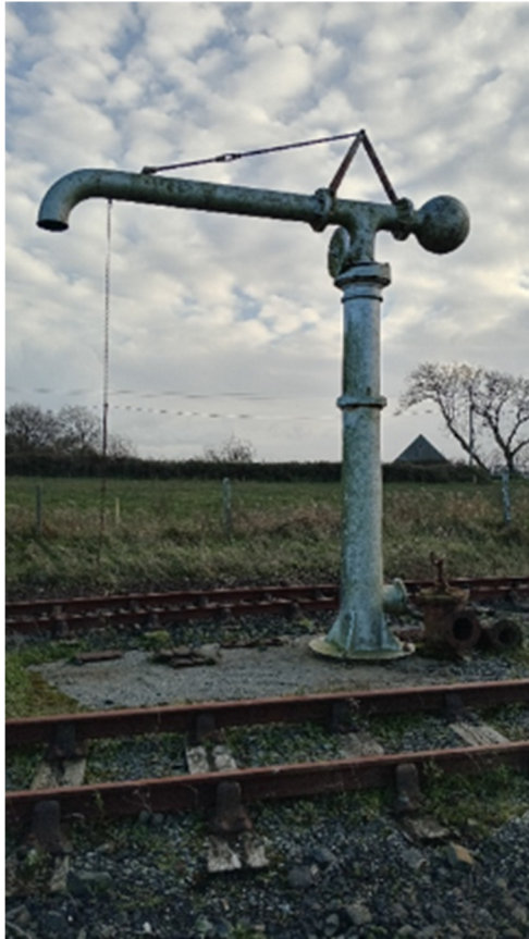
Plate 16.49: Water cooling crane (CH1.11), facing south