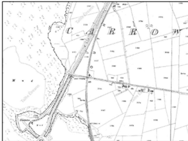
Plate 16.57: Extract from the 1898 OS map showing the drainage feature (CH1.25)