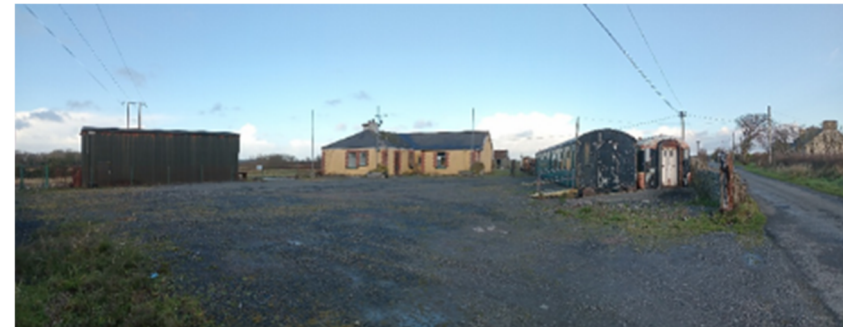
Plate 16.46: Moyasta Railway Station (BH13) within area of railway infrastructure (CH1.11), facing northeast