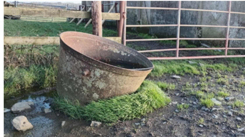
Plate 16.76: Famine pot (CH34)