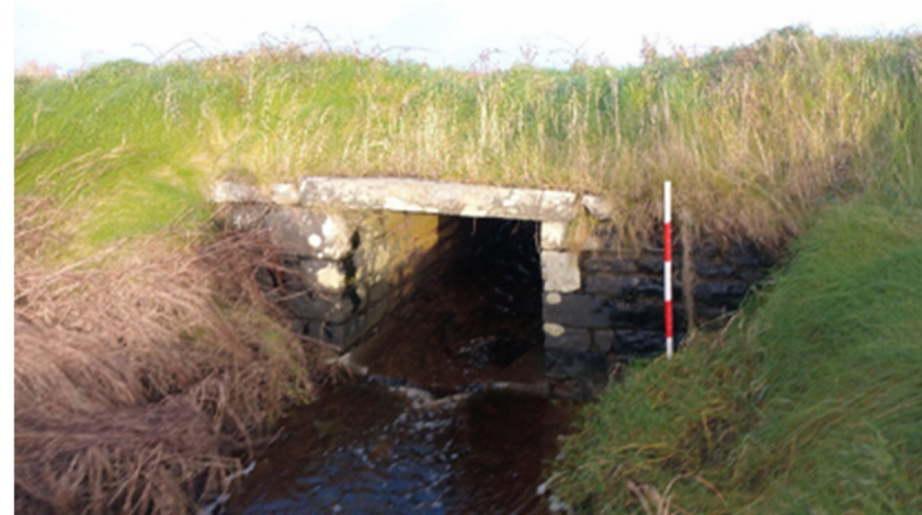
Plate 16.52: Stone-built culvert (CH1.23) situated under CH1, facing northeast