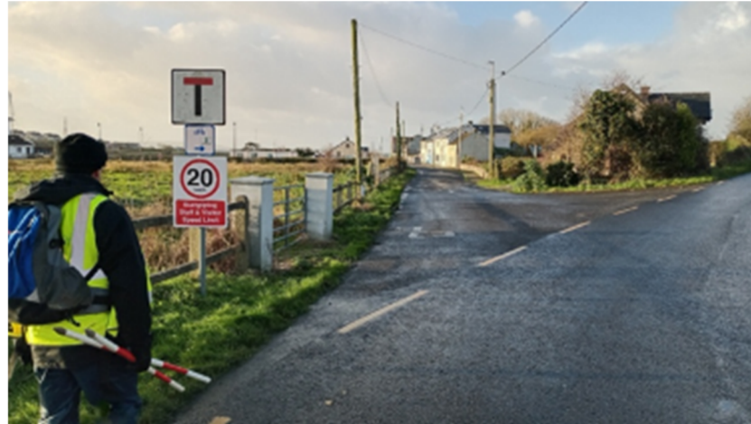
Plate 16.87: Shanakyle Road (TB8), facing west-southwest.