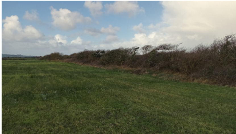
Plate 16.63: Former railway line (CH1), facing northwest