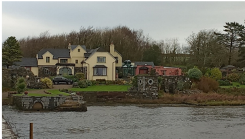
Plate 16.19: Modern house/ former Blackweir Railway Station (CH1.7), facing north