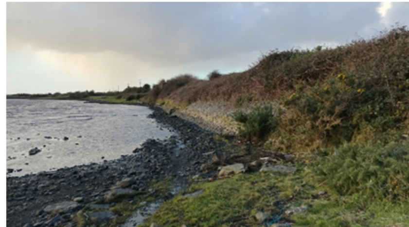
Plate 16.78: Substantial stone-built embankment supporting former railway (CH1), facing west