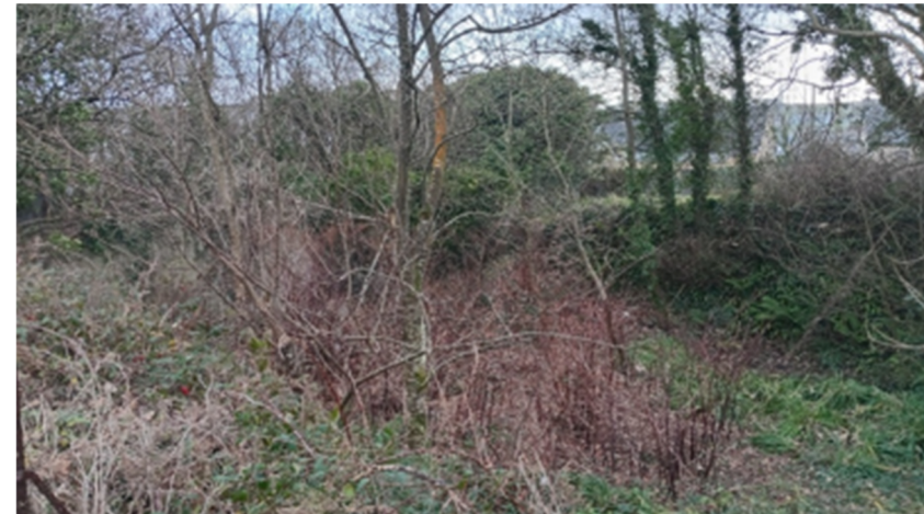
Plate 16.84: Former railway (CH1), heavily overgrown,, facing southeast