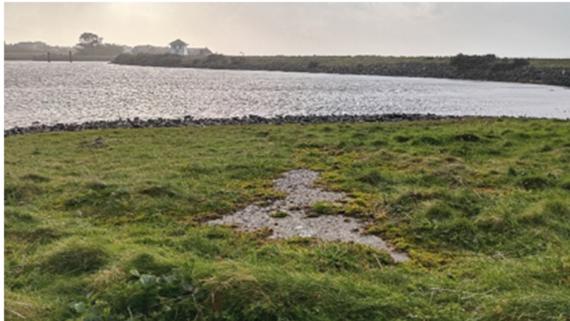
Plate 16.77: Possible slipway (CH35), facing south