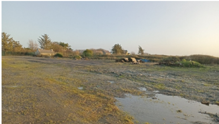
Plate 16.43: Abandoned railway yard (CH1.12), facing southeast