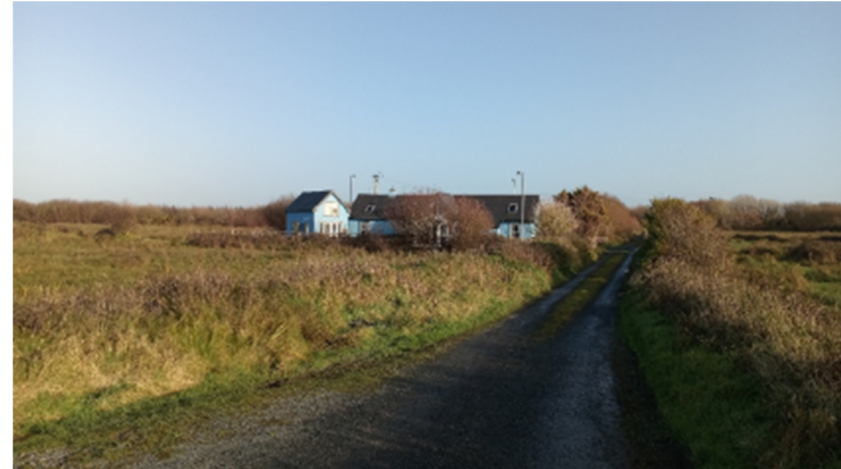
Plate 16.60: Townland boundary between Carrowncalla North and Carrowncalla South (TB6) and former Keepers Cottage and Level Crossing (CH1.16), facing east