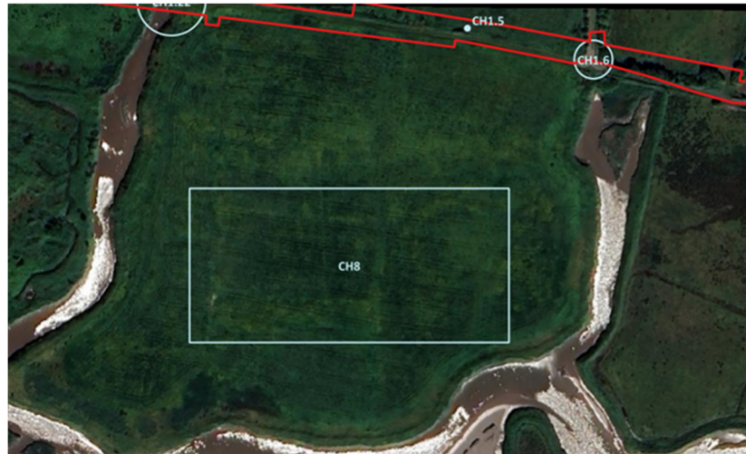
Plate 16.1: Rectangular and sub-circular anomaly CH8