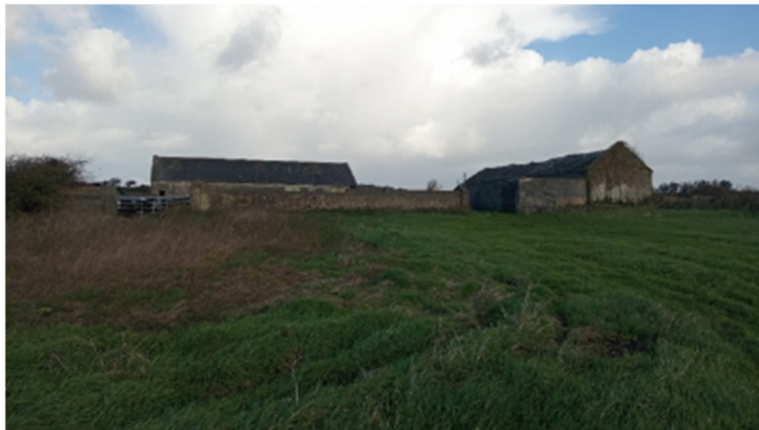
Plate 16.65: Two stone-built structures (CH27), facing north