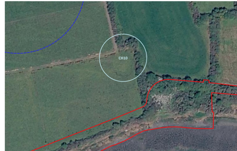
Plate 16.2: Sub-circular anomaly CH10