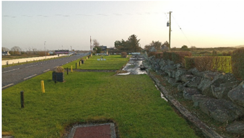
Plate 16.39: Small preserved portion of the old road at Moyasta Junction, facing south