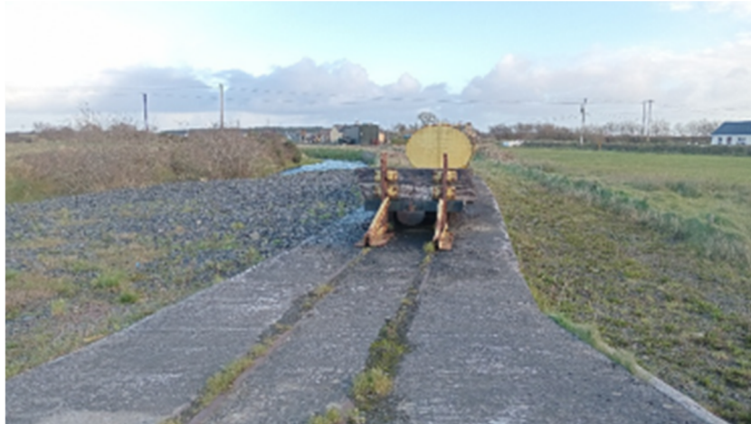
Plate 16.45: Railway tracks at Moyasta Junction (CH1.11), facing east