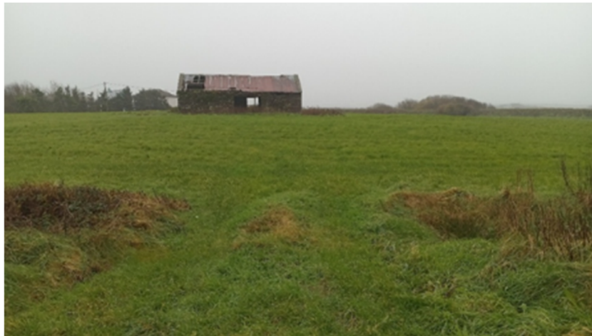
Plate 16.7: Overgrown bridge crossing former railway (CH1), ruinous vernacular structure (CH3) in background, facing south