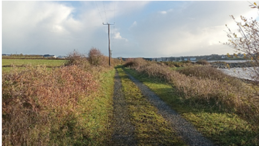
Plate 16.67: Former railway (CH1), facing east-northeast