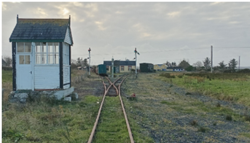
Plate 16.47: Signal box and railway tracks, facing northeast