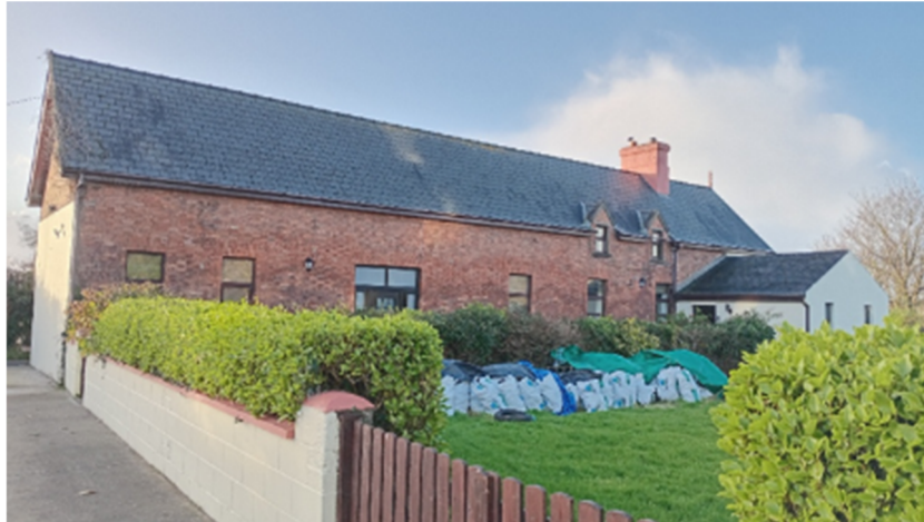
Plate 16.89: Former Kilrush Railway Station (BH20), facing southwest.