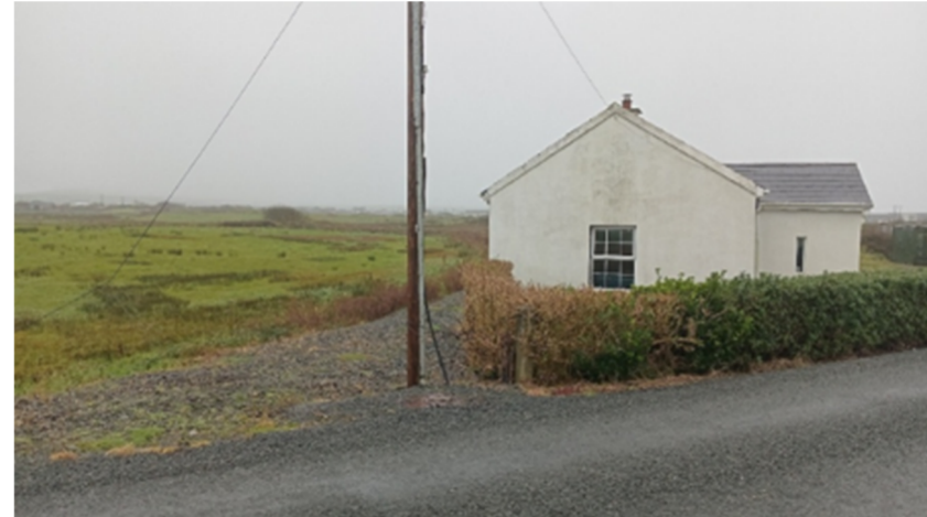
Plate 16.6: Former level crossing and keeper's cottage CH1.1, Dough townland, facing west