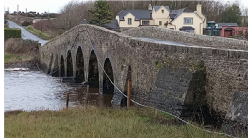
Plate 16.22: Blackweir Bridge (BH12), facing north-northeast