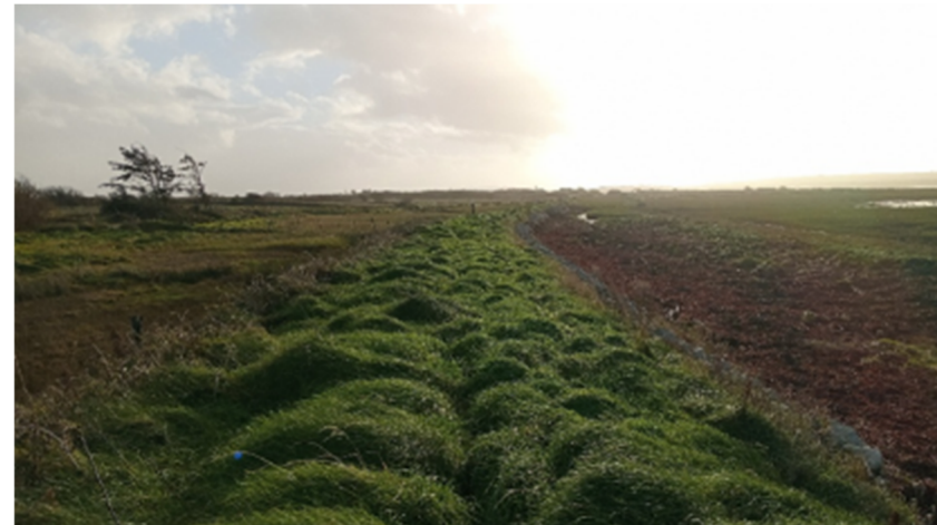
Plate 16.54: Former railway (CH1) on a stone embankment, facing south