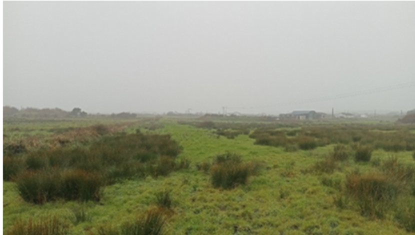
Plate 16.9: Former railway CH1) in Lisdeen townland, facing west-northwest