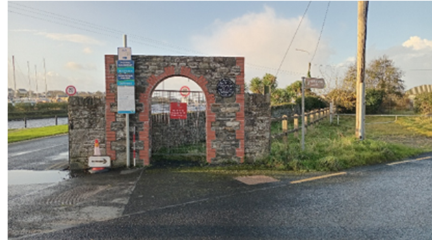
Plate 16.90: Stone-built arch (part of CH1.21), facing west