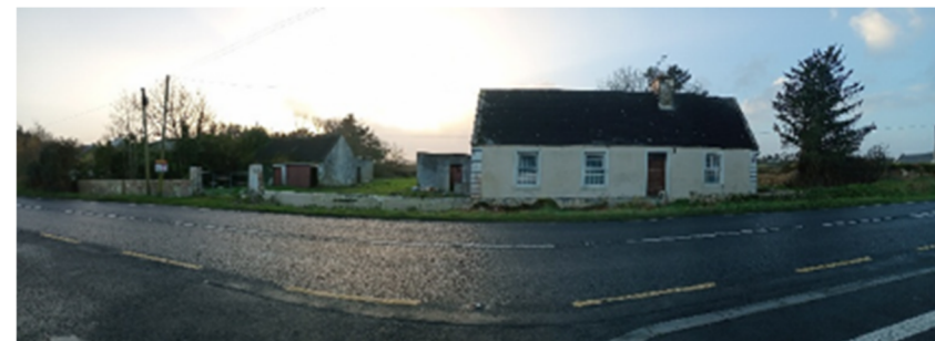
Plate 16.40: Group of structures (CH14), facing east-southeast