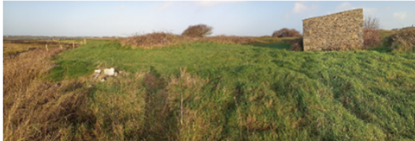
Plate 16.59: Ruinous vernacular structure (CH18), facing north