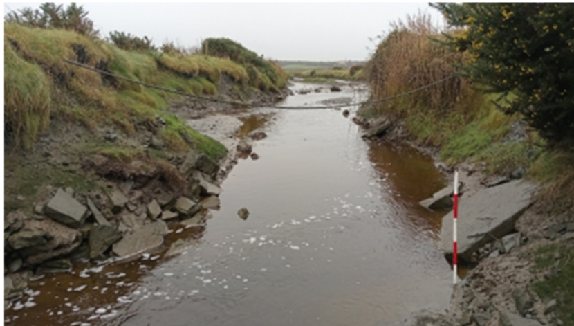
Plate 16.15: Flagstones and rubble (collapsed railway bridge, CH1.22), facing south