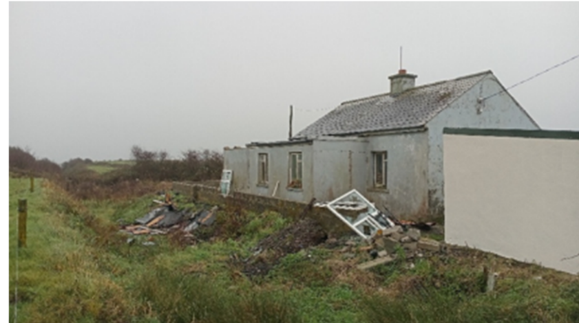
Plate 16.10: Level crossing keeper's cottage (CH1.3) situated adjacent to former railway (CH1), facing east