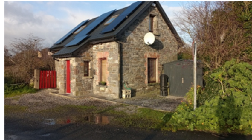
Plate 16.86: Level Crossing Keepers Cottage (CH1.24) facing northeast