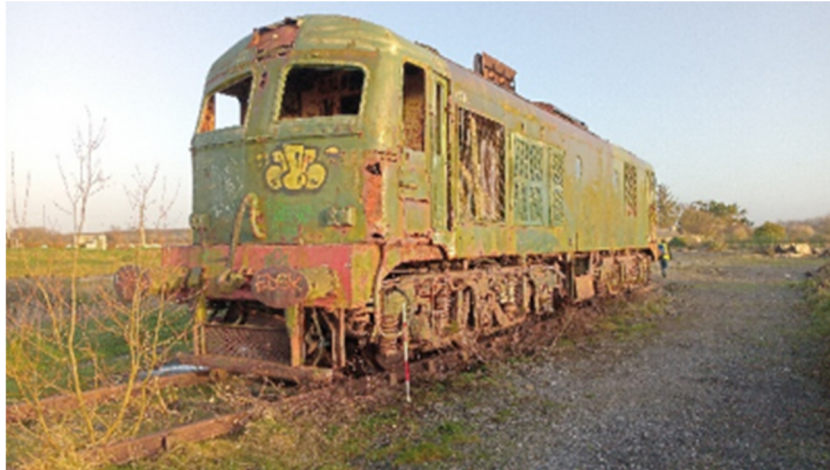
Plate 16.41: Train carriage in abandoned railway yard (CH1.12), facing east-southeast