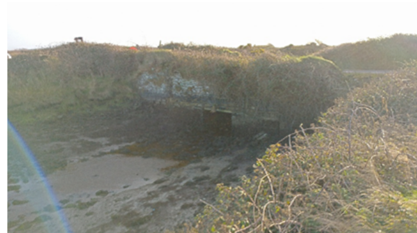
Plate 16.58: Bridge (CH37), facing south