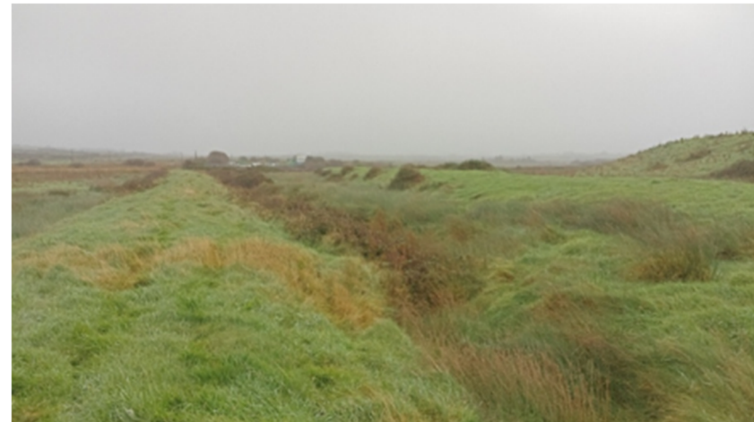
Plate 16.12: Main railway line (CH1) and short spur line (CH1), facing east