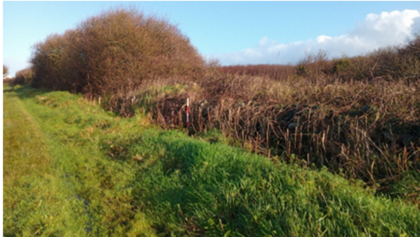
Plate 16.29: Baunmore-Moyasta townland boundary (TB4), facing northeast