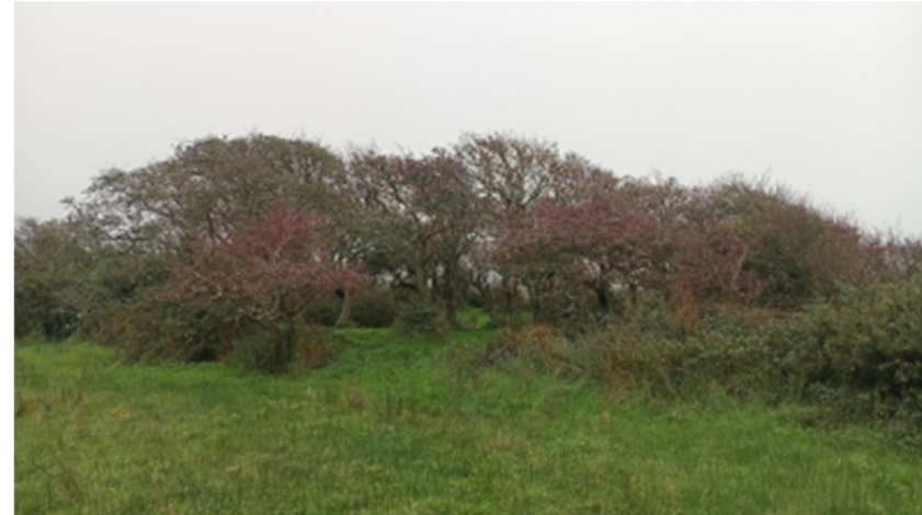
Plate 16.18: Ringfort (AH3), facing southwest