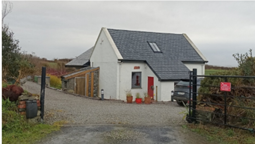
Plate 16.25: Former level crossing keeper's cottage (CH1.8), facing southeast