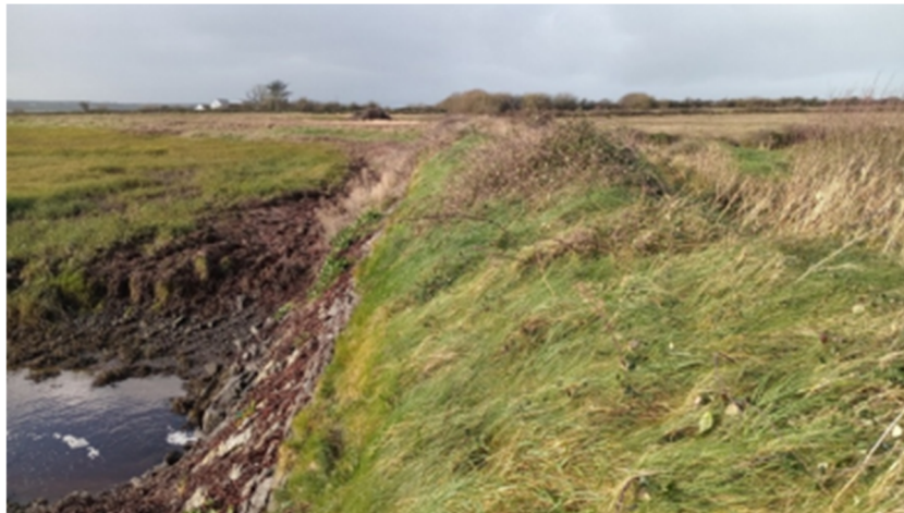
Plate 16.35: Former railway (CH1) running through the Shannon mudflats on top of a stone embankment, facing west