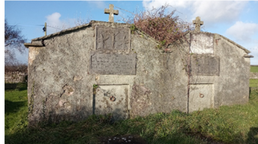
Plate 16.72: Mid-19th-century mausoleum, facing west