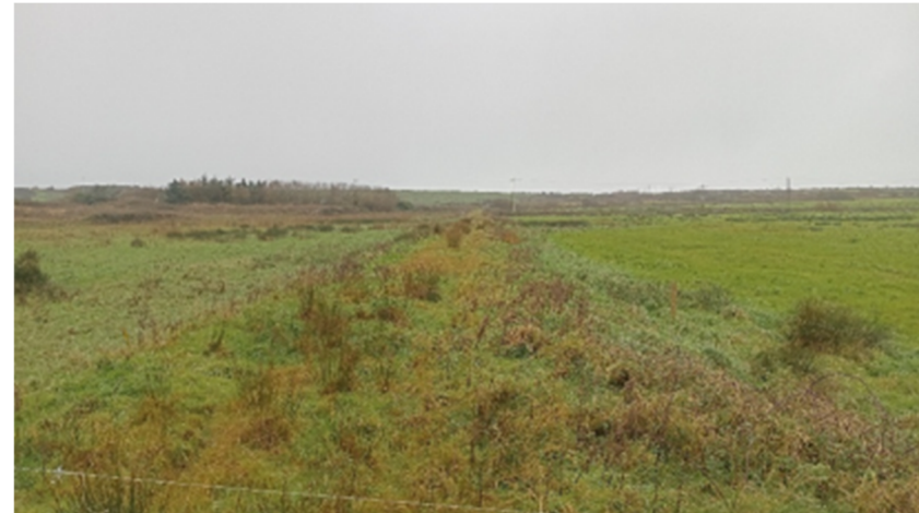
Plate 16.14: Former railway (CH1), facing west